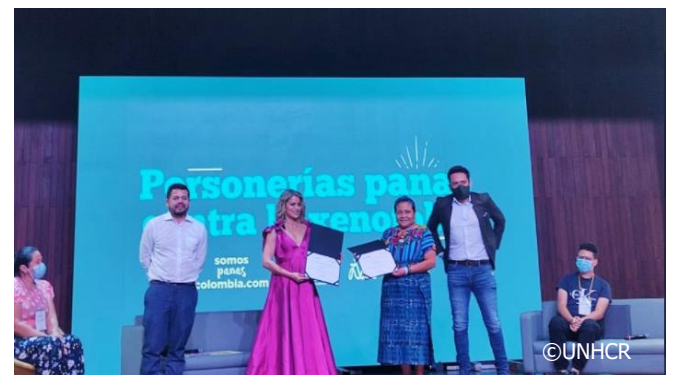
Rigorberta Menchú, Guatemalan Nobel Peace winner, and Colombian singer Andriana Lucía, participated in the "Ombudspersons Against Xenophobia" event and shared their messages on about solidarity and integration.

The number of Venezuelans fully vaccinated against COVID-19 corresponded to only 2% (37,035 people) of a total of 48% Colombian population fully vaccinated with over 56 million doses of COVID-19 vaccines. New vaccination points for Venezuelan refugees and migrants opened in the municipalities of Facatativa, Madrid, Mosquera, Soacha, Cota and Zipaquira (Cundinamarca) and in departments bordering Venezuela. UNHCR together with IOM and the Ministry of Health carried out health affiliation campaigns benefiting 22,287 Venezuelan refugees and migrants as well as capacity building workshops with 7,137 government employees and 14,859 Venezuelans.