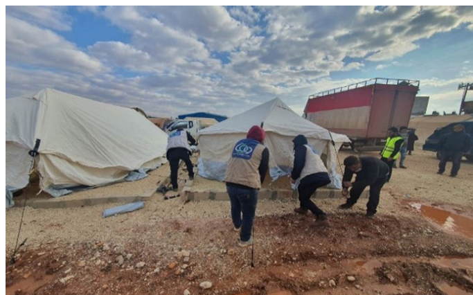
Tent installation in Idlib.

UNHCR's protection partners conducted awareness raising and psychosocial support sessions, identified cases and referred them to basic services in Idlib and Aleppo; such community-based protection interventions reached 15,668 people in December. Moreover, additional 277 displaced and vulnerable people received protection services such as awareness raising on civil status documentation and housing, land and properties, legal consultation and assistance.