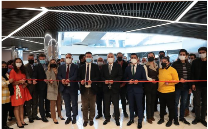
Representatives from Denizli Metropolitan University and UNHCR inaugurate the Denizli Youth Academy