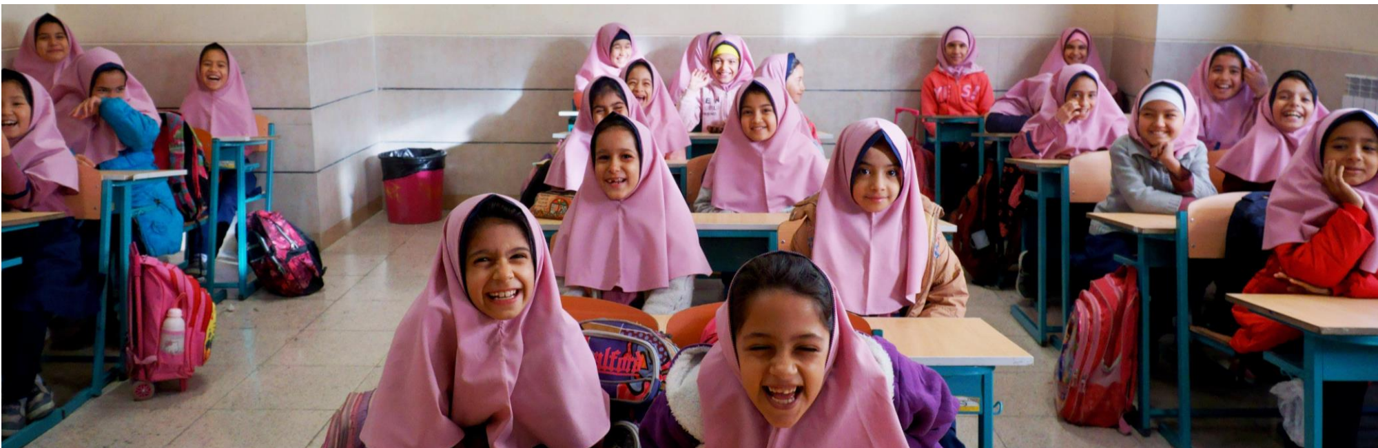
Iran: Afghan refugee sisters in Isfahan, Iran, go to school for the first time.

skills development and social protection to mitigate the impact on national systems and support the inclusive policies of the host governments, benefiting both host communities and refugees. These investments will also build Afghans' human capacity and resilience and eventually enable sustainable return and reintegration when conditions are conducive. In line with the Global Compact on Refugees (GCR), the Solutions Strategy for Afghan Refugees (SSAR), the SSAR Support Platform launched at the Global Refugee Forum in 2019, and the implementation of the SDGs, the 2022 RRP will support host governments in their efforts to promote resilience. It will aim to ensure that no one is left behind and that the needs of Afghans and their host communities can be met.