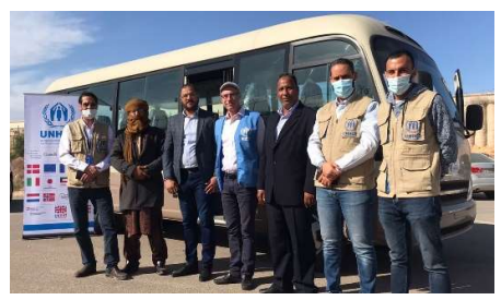
The handover ceremony in Awal, attended by UNHCR Chief of Mission and representatives of the cities of Awal and Dirj.

On 15 November, UNHCR resettled 71 refugees, including 37 children, who travelled from Tripoli to Canada, with the support of the International Organization for Migration for departure arrangements. The group included women and girls at risk, survivors of violence and/or torture, and persons with medical conditions or legal and/or physical protection needs. On the same day, a family of four also departed to Norway. Flights were on hold for most of the year due to a government decision but have resumed recently.