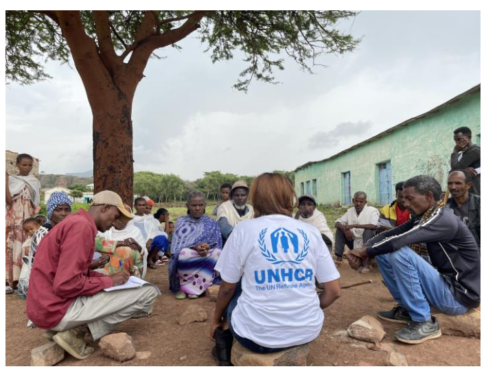
The community of internally displaced people in Abi Adi, where UNHCR recently opened a new office, discusses challenges and pressing needs with UNHCR teams on the ground.

UNHCR has boosted its response, setting up new field offices across the region to be closer to those forced to flee. However, UNHCR and partners continue to face challenges such as shortage of fuel and cash, and absence of electricity that are negatively impacting our ability to deliver assistance.