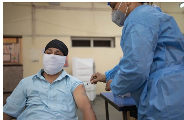
Refugees and asylum-seekers in Delhi receive their first jab of the coronavirus vaccine. Till 31 August 2021, 20,165 refugees and asylum seekers have been vaccinated, which includes the Sri Lankan refugees not registered with UNHCR.

Further, the socio-economic impact of the COVID-19 pandemic continues to affect refugees and asylum seekers. The number of refugees and asylum-seekers requesting basic assistance has increased, including for food, rent and medicines.