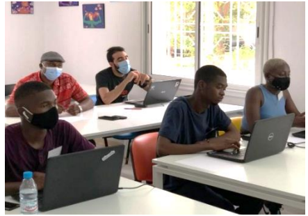
Refugee and asylum-seekers take part in a coding boot-camp organized by We Code Tunisia and Power Coders.

During September, UNHCR partner the Arab Institute for Human Rights (AIHR) organized the first editorial board meeting for an Arabic e-journal on displacement issues, launching