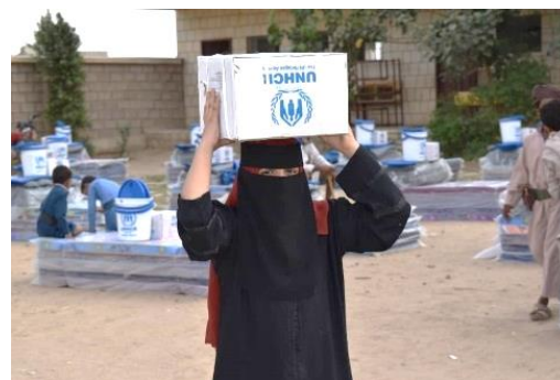
A widowed displaced Yemeni woman collects core relief items at a UNHCR distribution area for her family in Sa'ada, Yemen

Widespread flooding over recent months has affected more than 13,500 families across Yemen. Since late July 2021, torrential rains and widespread flooding have destroyed homes and caused widespread damage to infrastructure. Displaced Yemenis living in informal sites have been among the most affected. Access to clean water and adequate shelter have been particularly impacted in the most affected areas. UNHCR is working to ensure the provision of CRIs and emergency shelter kits for those most urgently in need of assistance.