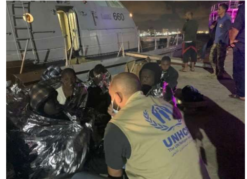
Staff provide assistance at disembarkation point, Tripoli Naval Base 11 Oct.

So far in 2021, a total of 26,314 refugees and migrants have been reported as rescued/intercepted by the Libyan Coast Guard (LCG). On 11 October, 177 people disembarked at Tripoli Naval Base including 31 women and 13 children. Bodies of 15 persons were recovered during the operations. The passengers had set off from Zwara (116 km west of Tripoli) and Alkhums (122 km east of Tripoli) the night before. UNHCR and medical partner, the International Rescue Committee (IRC), were present at disembarkation points to provide urgent aid and medical assistance. This year, more than 109 bodies have been recovered while 347 persons remain missing.