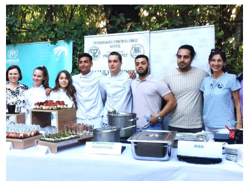
Delicacy Monday social cohesion event, Belgrade, 27 Sep 2021

UNHCR and partner CRPC supported three LGBTI asylum-seekers from Tunisia in participating in Belgrade Pride Parade on 18 Sep.