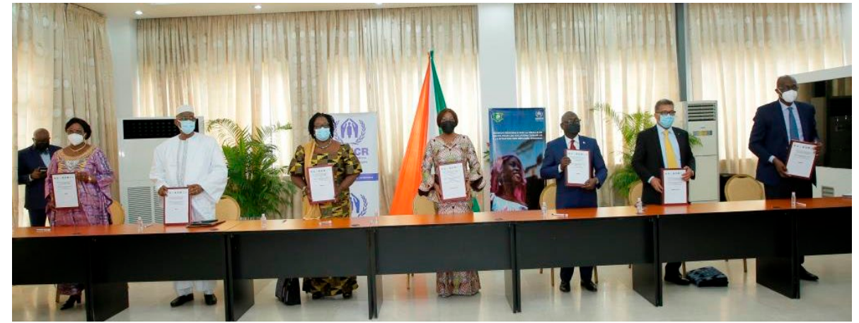
Abidjan - Official signature of the joint declaration leading to cessation of refugee status