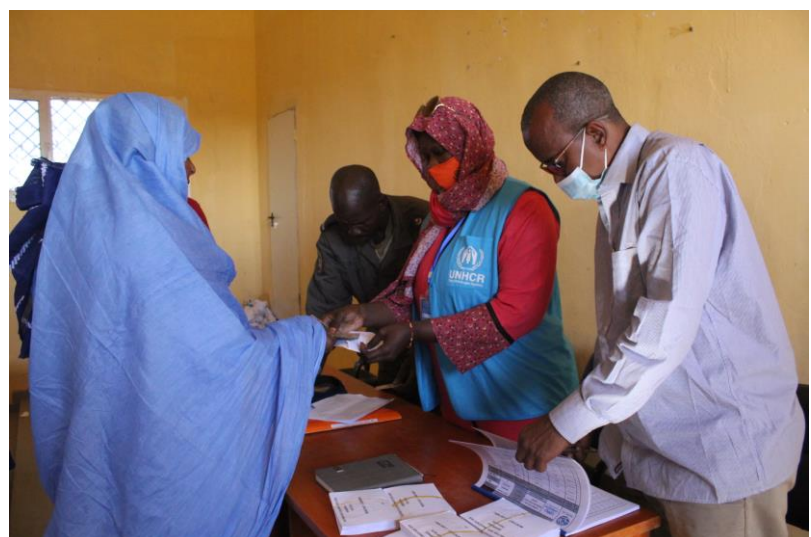
A refugee woman in the host community receiving cash assistance from UNHCR