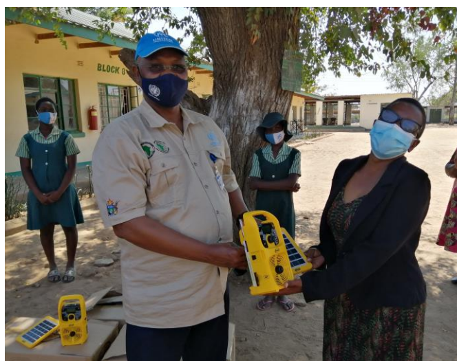
Solar radios support remote learning in Tongogara camp primary school.