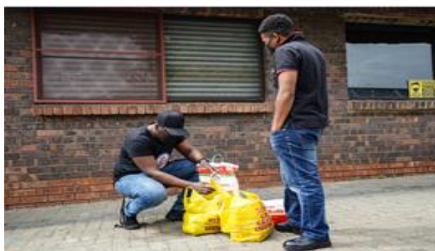
The Fruit Basket staff distributing food and essential household and hygiene items to LGBTQI+ refugees in Johannesburg, South Africa.