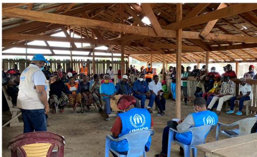
New arrivals from CAR at an orientation session with UNHCR in Bétou.