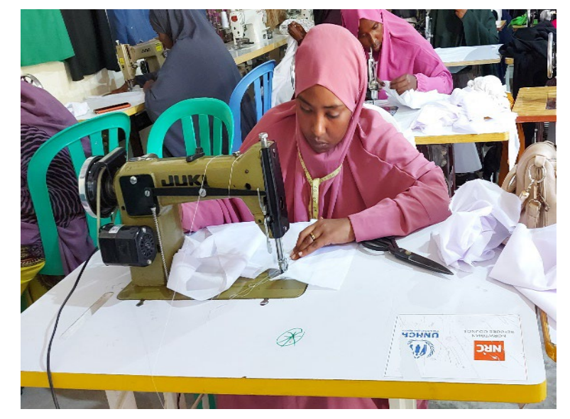
A young female participating in a tailoring class in Somaliland.

Across Puntland and Galmudug, 145 refugees, IDPs and host community members continued their vocational training in different subject fields, including hair dressing tailoring, electrical works. Literacy classes for adults