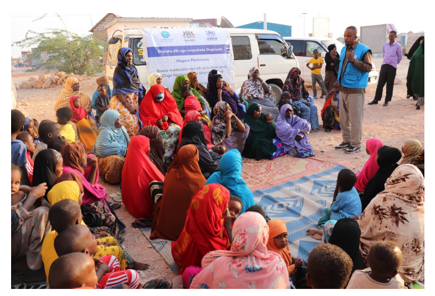
The residents of Israac village in Galkayo receive back-to-school sensitization.