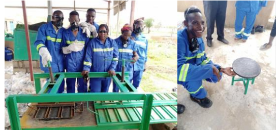
Malian refugees during their training on the transformation of plastic waste. Goudoubo Camp, Dori.