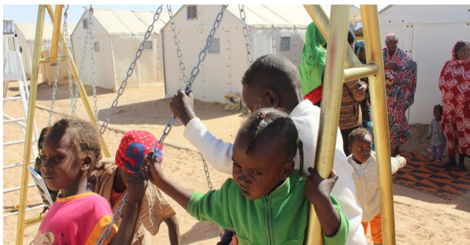
Refugee children awaiting resettlement playing at the humanitarian center in Agadez