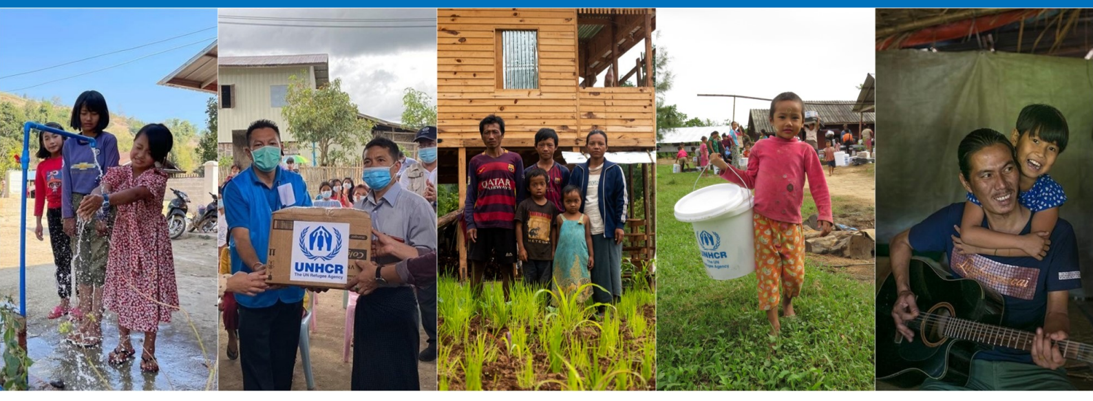
Fact Sheet | August 2021