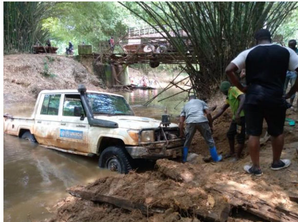
Poor road conditions make delivering humanitarian assistance a huge challenge between Gbadolite and Yakoma.