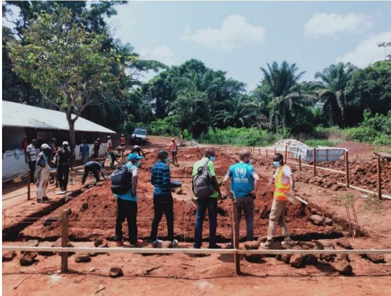
UNHCR's partner AIRD is constructing durable classrooms to replace emergency infrastructures in Modale site, North Ubangi province.

Unaccompanied refugee children identified