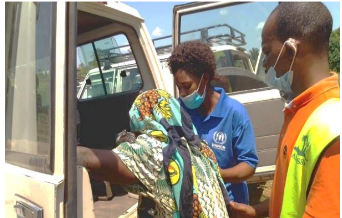
UNHCR and partner ADSSE assist a Central African refugee woman to board a vehicle during a relocation from Yakoma to a safer site in Modale, North Ubangi province