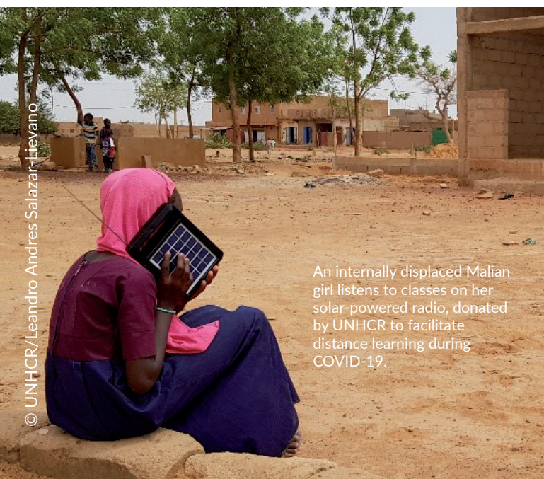
An internally displaced Malian girl listens to classes on her solar-powered radio, donated by UNHCR to facilitate distance learning during COVID-19.

As a country of asylum, MALI has received over 48,000 refugees and asylum-seekers from Burkina Faso, Niger and Mauritania, out of which 60% are children. A significant increase in the refugee population has been noted in recent months, mainly in the border areas of northern and central Mali following the deterioration of the security situation in neighbouring Burkina Faso and Niger. Additionally, Mali also has close to 350,000 IDPs within the country. Many children and youth do not have access to government-sponsored integration projects due to several factors, including issues with identification of individual needs, remoteness of localities of return and an emphasis on group assistance. These children and youth at-risk often resort to returning to migration routes in search of opportunities, as smuggling networks from the capital to the border regions in the north of the country are widespread. Unaccompanied or orphaned children are particularly vulnerable to trafficking and exploitation, including sexual exploitation, forced begging or selling goods on the streets, and other dangerous forms of child labour.