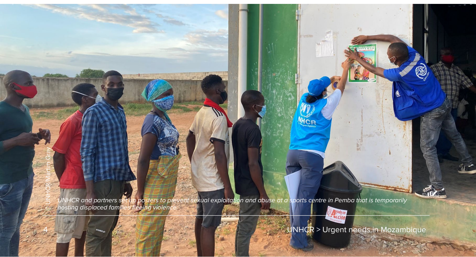
UNHCR and partners set up posters to prevent sexual exploitation and abuse at a sports centre in Pemba that is temporarily hosting displaced families fleeing violence.

Fostering livelihood opportunities and professional skill training for IDPs and host communities represents an important part of UNHCR's response. This will enable displaced populations to rebuild their lives if and when they are able to return in safety and dignity, and will strengthen social cohesion with the host communities who shelter the majority of the newly displaced.