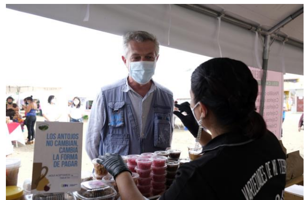
Thirty-year-old Nicaraguan asylum-seeker meets UN High Commissioner for Refugees Filippo Grandi at her stall at a market in Upala near Costa Rica's border with Nicaragua. She received training and financial support from UNHCR's partner Fundación Mujer to be able to sell sweets using recipes from home.

Asylum countries and communities have shown great solidarity with Nicaraguan refugees and asylum-seekers, and it will be key to keep supporting them as they ensure protection and promote local integration of Nicaraguans amid a challenging pandemic context. UNHCR has renewed its call on the international community not to turn a blind eye to the plight of Nicaraguan refugees and asylum-seekers, as the pandemic exacerbates their vulnerabilities and needs.