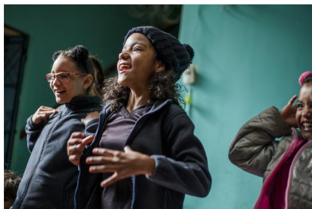
Photo: UNHCR / William Wroblewski. Venezuelan children doing recreational activities in a child friendly space in La Paz