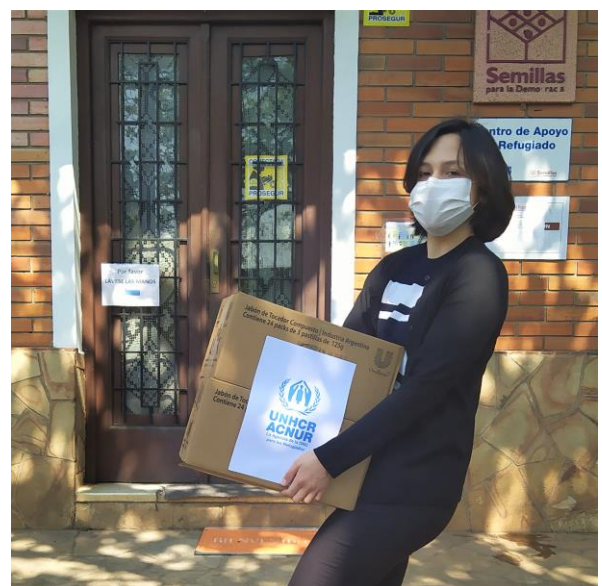
During COVID 19, UNHCR worked together with partner agency "Semillas para la Democracia" to bring humanitarian assistance to refugees.