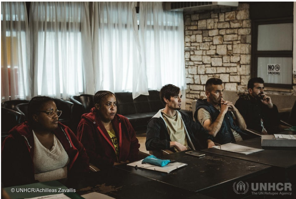
Refugees attending a vocational training programme to develop job skills.

In May, Greece established the profession of “cultural mediator” through the creation of an official profile by the National Organisation for the Validation of Professional Qualifications of the Ministry of Education. A cultural mediator serves as the bridge between refugees and the host country, its administration, public services and even local communities. This is a positive step for refugees’ employment and may help integration, particularly for the newly recognized refugees.