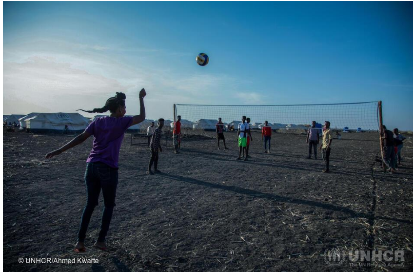
Ethiopian refugees playing volleyball near the Youth Centre at Tunaydbah settlement in East Sudan.

UNICEF and State Council of Child Welfare (SCCW) continue recreational activities in child friendly spaces in Um Rakuba, Tunaydbah and Village 8. Nearly 530 children participate.