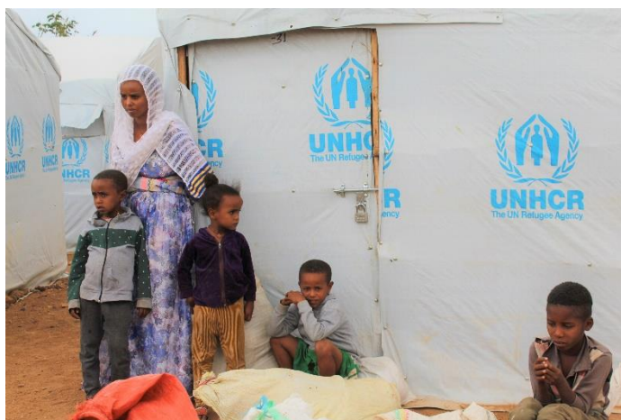
Eritrean refugees relocated to Mai Aini camp are supported with emergency shelter.

In the Mai Tsebri camps (Mai Aini and Adi Harush), many relocated refugees were temporarily hosted in communal sites in schools and Early Childhood Care Centers. UNHCR has now moved all refugees to emergency shelters, allowing schools to resume classes and other activities to restart.