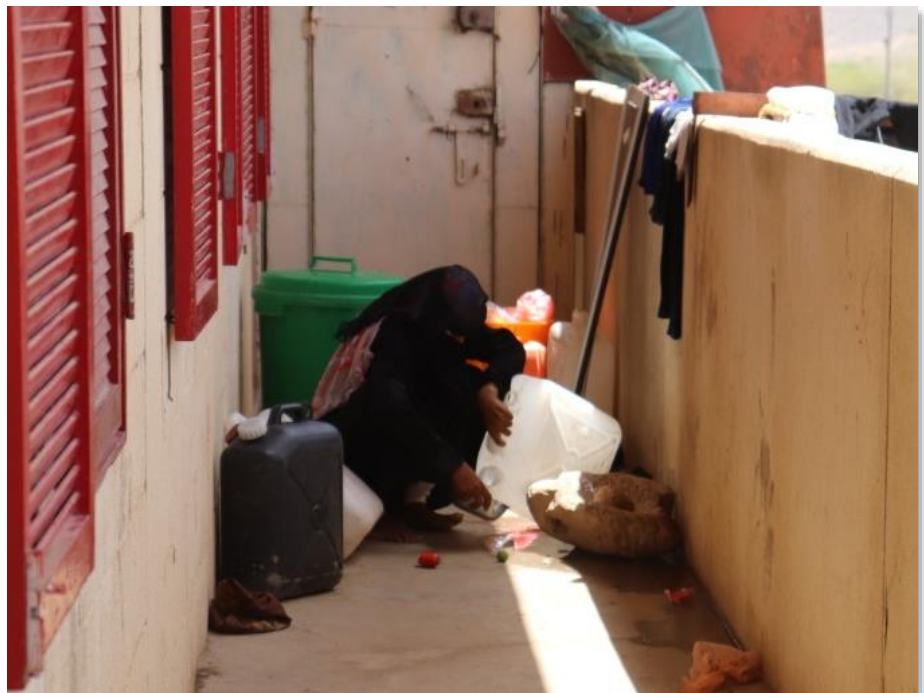
IDPs face severe water scarcity and mostly rely on the generosity of local community to meet their needs.

In Maqbanah district, shelter and CCCM Clusters' partners provided emergency shelter and NFI kits to 50 families . Local authority in the governorate provided food baskets to 62 families . The Rapid Response Mechanism (RRM) cluster provided food and hygiene/dignity kits to some 82 families through UNHCR's partner Deem.