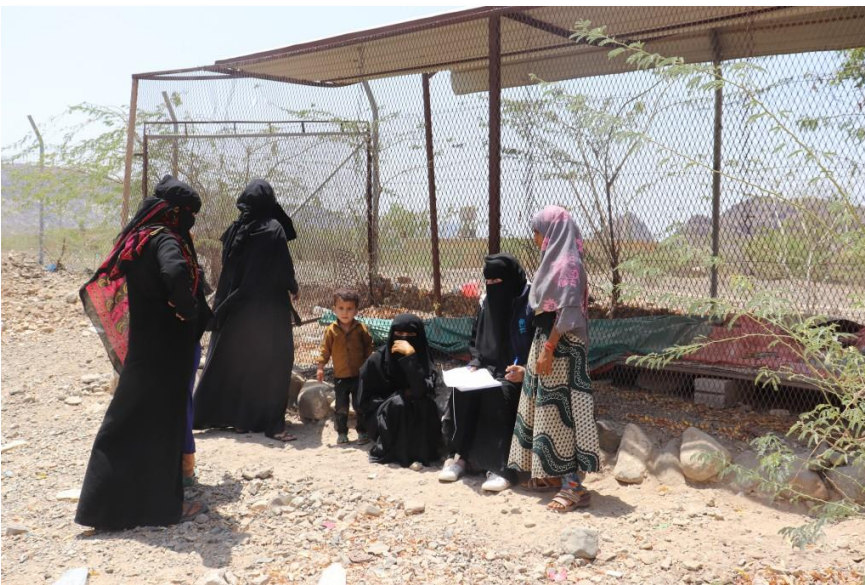
UNHCR partner DEEM conducts Rapid Protection Assessment for the newly displaced in Maqbanha district.

Over a hundred displaced families have arrived in Jabal Habashi district - most of them escaped armed violence, forced to abandon everything behind and walk to the nearest place of safety in Jabal Habashi district. They are living in harsh conditions, without access to basic services. The closest market and health facility are 16 km away from where the displaced population is sheltering. They have no access to water and sanitation services and have relied so far on water provided by the host community and food from humanitarian organizations.