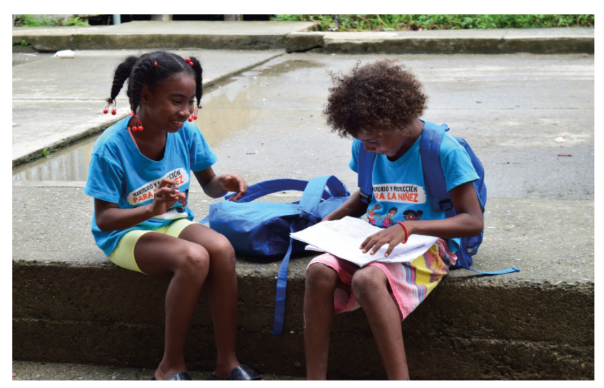
UNHCR in coordination with its partner, Fundescodes, provides child-friendly spaces for boys, girls and adolescents in Buenaventura, Valle del Cauca department.

The operation's mixed protection and solutions strategy ensures that IDP interventions are in line with this new policy, with priorities including: