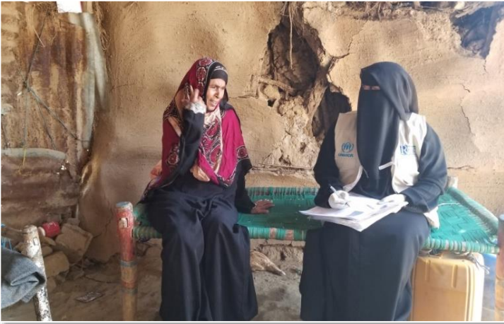
UNHCR partner RADF conducts assessments targeting those newly displaced in Abs district

UNHCR has shared the findings of the assessments with all humanitarian partners to formulate a coordinated response. The Operation has also distributed NFIs to the 95 families assessed. While the needs on the ground are acute, provision of humanitarian aid continues to face certain challenges due to inadequate access to the affected populations. UNHCR and partner staff continue to increase efforts to ensure that support is provided and that new gaps arising from lack of capacity or access by other actors are duly addressed.