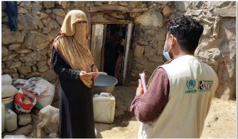
UNHCR partner RADF providing psychosocial counselling and support to newly displaced IDPs living with relatives in Abs district, Hajjah Governorate

The findings further show that needs are vast and across all sectors, including health, shelter, non-food items (NFIs), protection, and food security, for the newly displaced but also for the existing populations on sites. Some 95 families (570 individuals) are in urgent need of shelter assistance, NFIs, and cash to buy food, while some 90 households have reported not having access to WASH facilities. The assessments also revealed that at least five elderly persons with chronic medical conditions require urgent health interventions.