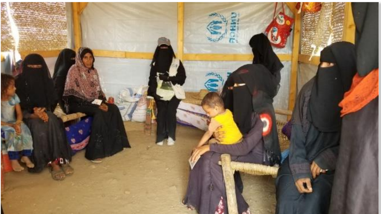
UNHCR partner RADF conducts assessments targeting those newly displaced in Abs district, with specific focus on vulnerable women and children

Mobile protection teams deployed consisting of male and female staff members from RADF will continue to visit displaced populations in the area and follow up on the initial findings of the protection assessments. Protection teams will conduct further detailed interviews and provide targeted support to female headed households. UNHCR and partners will also ensure that those affected by the conflict are reached with PSS sessions, and that those lacking proper documentation receive adequate support. UNHCR will further advocate for safe spaces for women in particular (single women and female-headed households) and will identify and refer children at risk to specialized services.