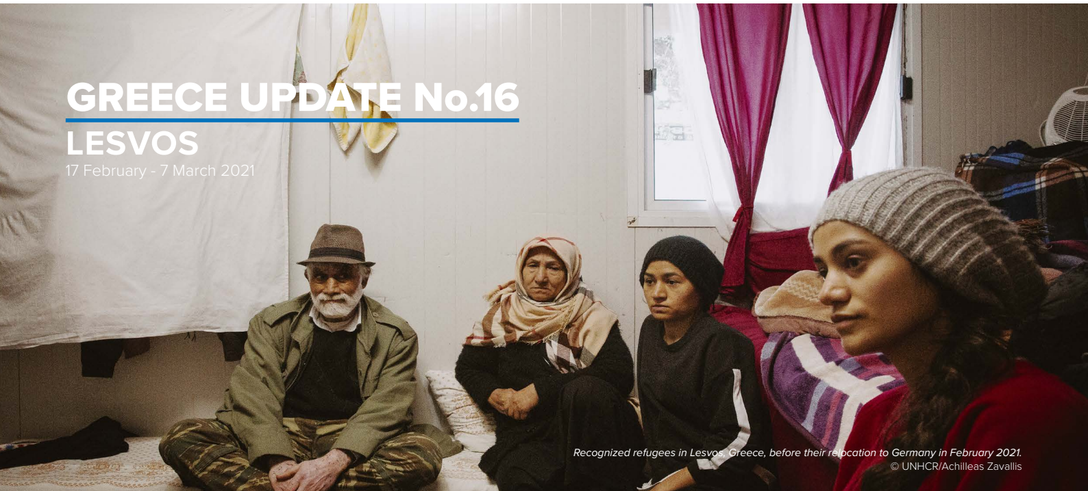
Recognized refugees in Lesvos, Greece, before their relocation to Germany in February 2021.

UNHCR, the UN Refugee Agency, is supporting the Government-led response after a series of fires destroyed the Reception and Identification Centre in Moria (Lesvos) in September 2020.