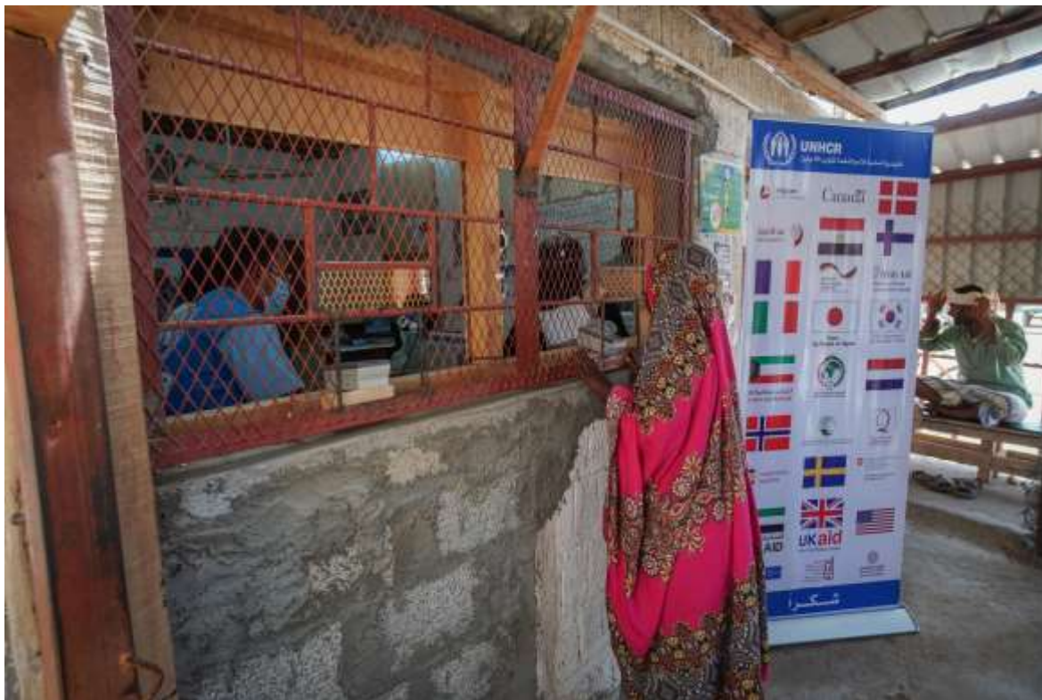
A refugee woman waits to receive her hygiene kits composed of soaps, detergent and sanitary pads at a distribution site in Kharaz Refugee Camp. March 2020.