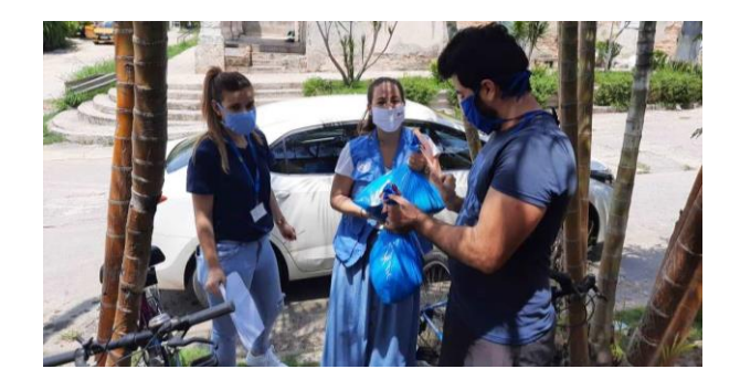
To address the needs of people of concern during the pandemic, UNHCR in Cuba delivers basic goods to refugee and asylum seeker families. UNHCR Cuba

For the first time, UNHCR is participating in the UN Sustainable Development Cooperation Framework recently signed with the Cuban government, as well as in the UN Socio-Economic COVID-19 Response Plan to protects vulnerable groups, including refugees and asylum seekers.