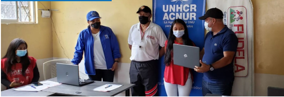
UNHCR and FUDELA donated 11 computers and 30 tablets to indigenous Awa students.

Thanks to the education projects carried out by FUDELA and UNHCR, the Awa indigenous population has become increasingly interested in higher education.