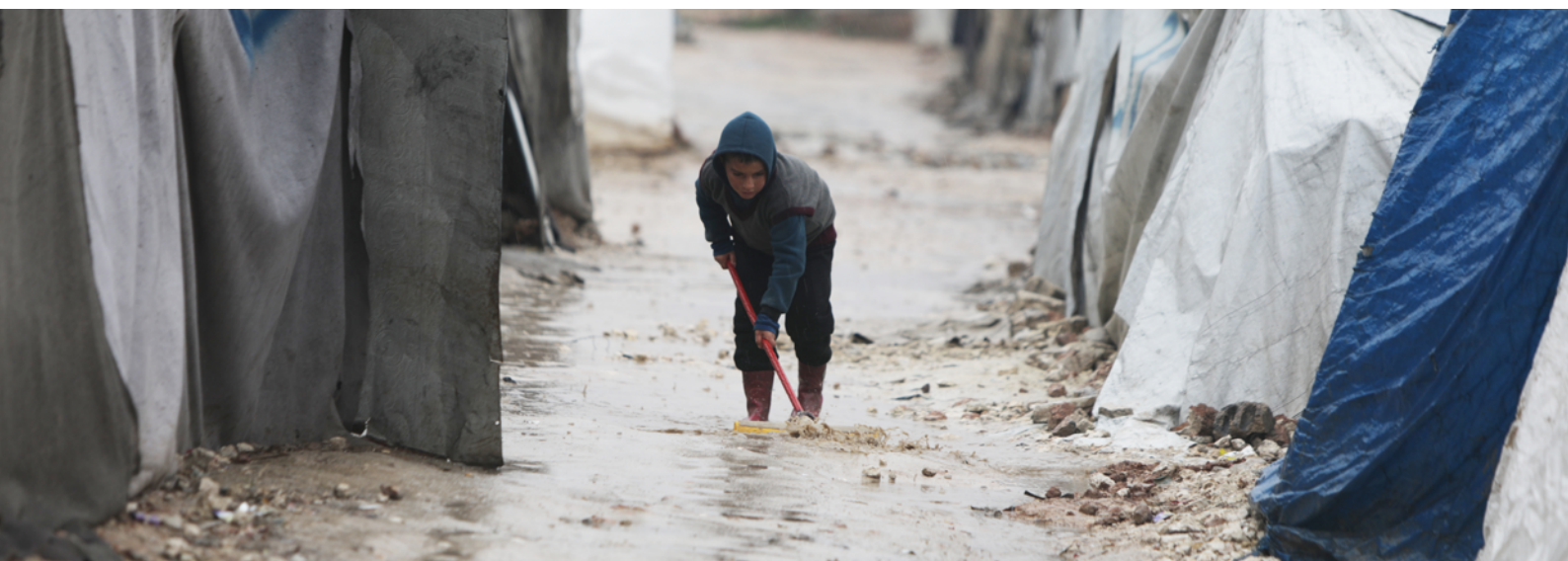
Almost 123,000 IDPs in Idlib, north-west Syria, were affected by flooding in January 2021.

The Shelter/NFI cluster has already distributed close to 2,000 NFI kits and another 6,000 kits will be distributed in the coming days.