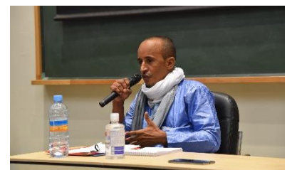
The Mauritania DAFI Club President during the UN75 dialogue

In collaboration with WHO, UNHCR organized the UN75 dialogue "Study the present to build the future" where DAFI refugee students discussed with the Nouakchott medical school students the importance of solidarity during the pandemic times. Together with UNDP, UNHCR took part in a radio show on peaceful coexistence broadcasted by the Bassikounou local radio. In addition to this, UNHCR also hosted in its facilities the UN75 live talk-show "The Mauritania we want" featuring young Mauritanian influencers.