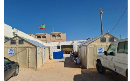
RHUs donated by UNHCR in Nouadhibou

As part of its activities in support of the Government's response for COVID-19, and at the request of the Chief Medical Officer of the Nouadhibou department, UNHCR donated two prefabricated buildings (Refugee Housing Units - RHU) which will be used to carry out the triage of patients before they access the department dispensary compound.