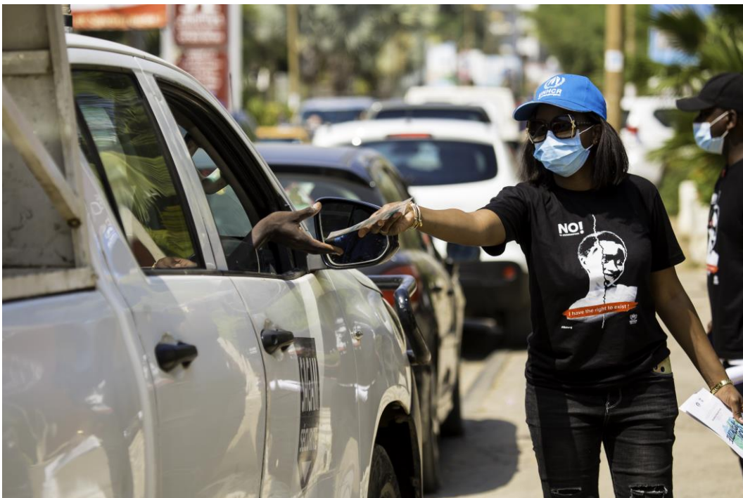
Sensitizing caravan within the #IBelong campaign against statelessness in Dakar, Senegal, 6 November.