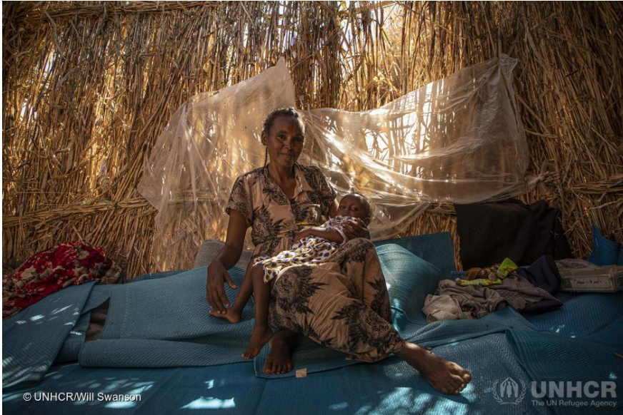
A refugee from Ethiopia sits with her young daughter in their makeshift shelter at the Um Rakuba camp.