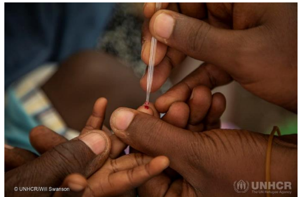
Refugee medical staff conduct a malaria test on a young refugee patient from Ethiopia in the Village 8 reception centre.

Nutrition teams are screening children under five and women for malnutrition and supporting with supplementary feeding programs.