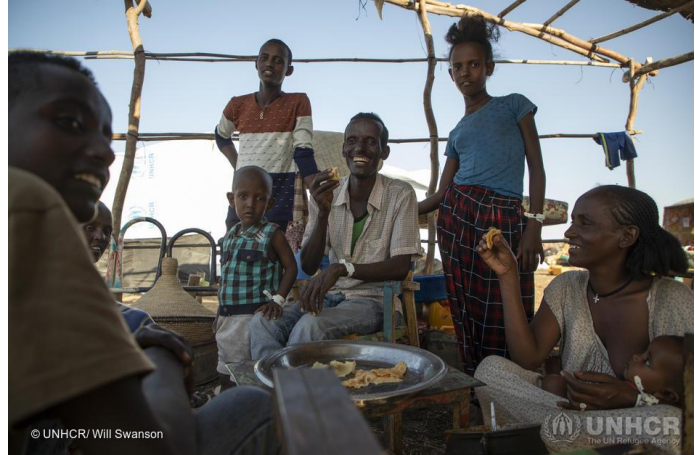
A refugee family from Ethiopia share a meal in their temporary shelter at the Hamdayet border point.

Food: Hot meals are being provided twice a day at Hamdayet reception centre by Muslim Aid with the support of WFP.