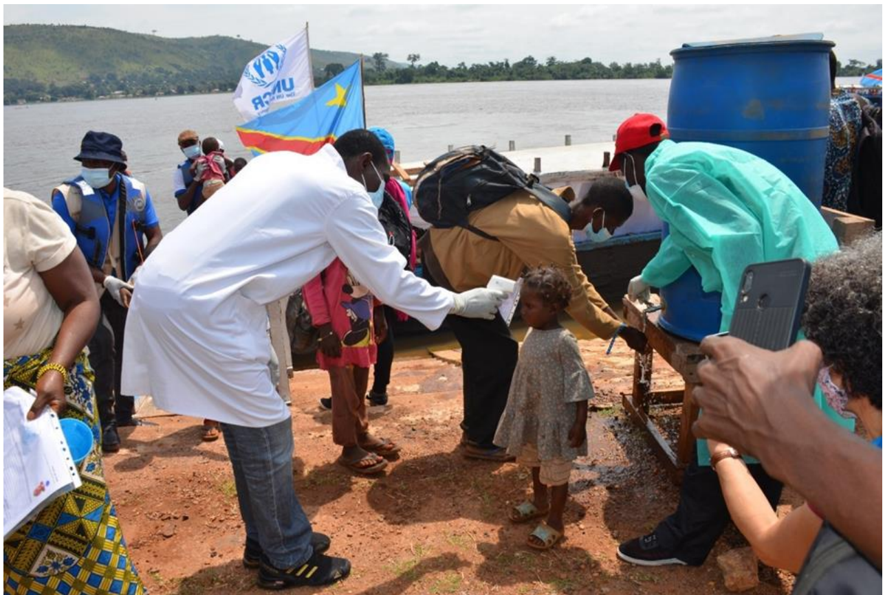
As UNHCR's facilitation of voluntary repatriation to the Central Africa Republic resume with the lifting of COVID-19 border closures, temperature checks and other preventive measures are implemented to mitigate the risks of contamination during these returns. @UNHCR CAR