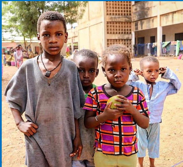
Malian children in an settlement for internally displaced persons in Bamako Mali (May 2020)

In Mali , persistent insecurity and deteriorating economic conditions due to the COVID-19 pandemic have caused a steep rise in trafficking of children, forced labour and forced recruitment by armed groups across the country. According to the latest report of the UNHCR-led Global Protection Cluster, 220 cases of child recruitment were documented in the first half of 2020, compared to 215 cases in all of 2019. The victims are disproportionately boys working at eight mining sites but also Malians, refugees, asylum seekers and migrants. Women and girls are also victims of abduction, sexual assault and rape, and in the Mopti region alone more than 1,000 cases have been recorded in 2020.