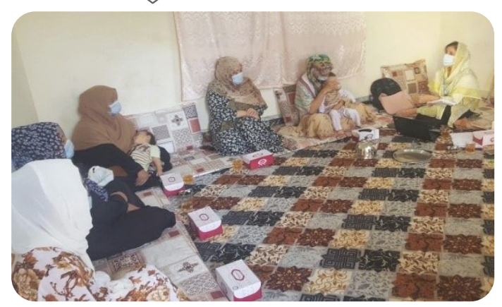
PA session with females in Attock, Puniab