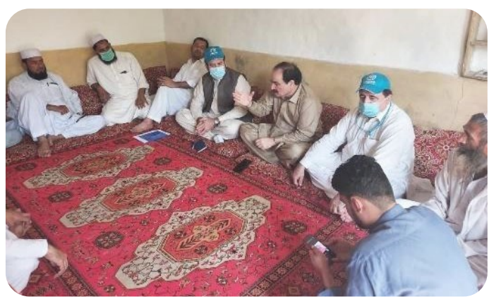
Meeting with refugee FPs, Naguman RV-Peshawar