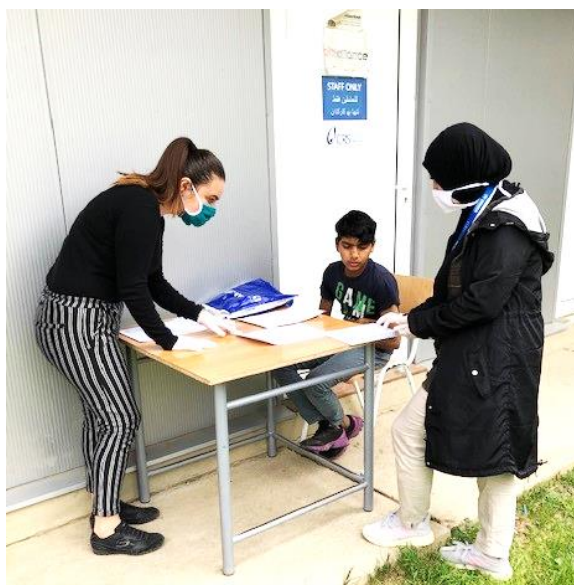
UNHCR partners making sure that schooling does not suffer during lock-down in asylum centres, ©Indigo, May 2020