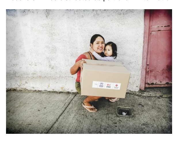
Santiago, Chile. Venezuelan mother and daughter assisted by UNHCR and IFRC with a monthly food box. April, 2020

Recently UNHCR and its partner World Vision International launched a cashed-based intervention (CBI) program to aid 560 households. The assistance is delivered through a virtual multipurpose voucher that enables refugee and migrant families to buy in local stores and supermarkets. This innovative method gives the families the opportunity to define what their most urgent needs are and choose the products they want to buy. As the southern hemisphere is entering the winter period, additional vouchers will be distributed as part of a winterization