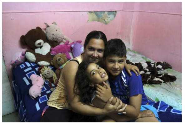
Arica, Chile. Asylum-seeking family assisted by UNHCR and its partner agency FASIC.

UNHCR in Chile has been strengthening its engagement with municipalities and local authorities. On the frontlines of the response to COVID-19, municipalities have had to find housing solutions, address urgent humanitarian needs of their residents (in particular the homeless, the elderly, refugees and migrants), ensure adherence to quarantine measures and maintain public services.