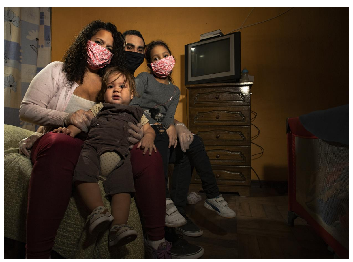
Santiago, Chile. Venezuelan Family supported by UNHCR and World Vision through e-vouchers that enables them to buy in stores and supermarkets. May,2020.

This winter, the refugee and migrant families will not only have to face the cold, rain, and low temperatures, but they will also have to protect themselves from COVID-19 in conditions of extreme vulnerability, often without access to housing, blankets, winter clothes, medicines or fuel to heat their homes.