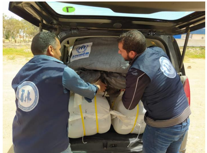
Distribution of blankets for confined patients in Djerba island

Counselling related to Mental Health and Psychosocial Support (MHPSS) was reinforced in order to respond to the increasing needs expressed by refugees and asylum seekers (cases of insomnia, acute anxiety, depression) both through phone or videocall and through visits to shelter for individual and group support conducted by psychologists from CTR.