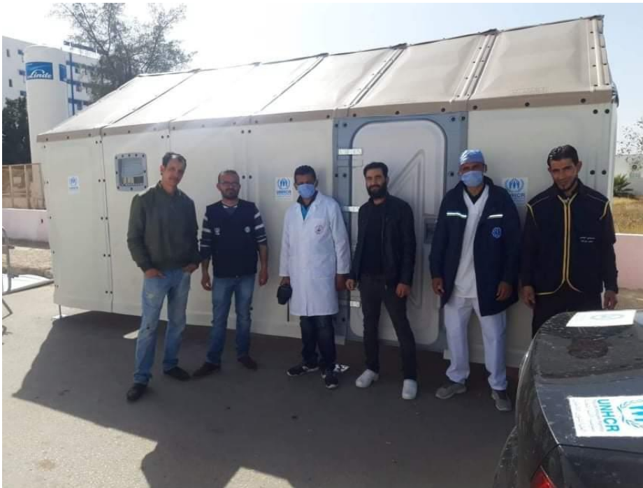
Refugee Housing Unit donated to Medenine Regional Hospital for visitors screening

UNHCR donated one Refugee Housing Unit to Medenine Regional Hospital, to be used for screening the visitors before entering the hospital. Moreover, 100 blankets were donated to Medenine Governorate for the persons under confinement coming from Djerba island.