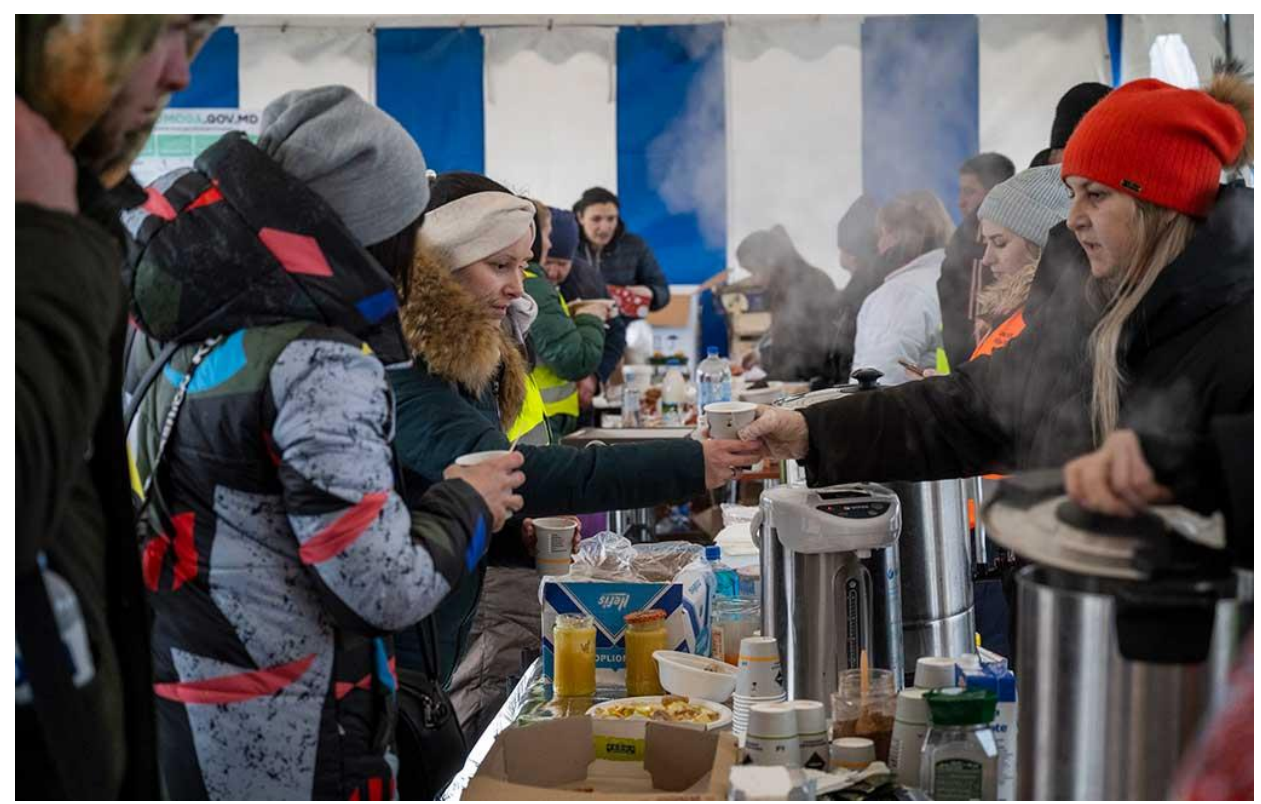
Volunteers serve hot food and drinks to Ukrainian refugees in Palanca, Moldova.