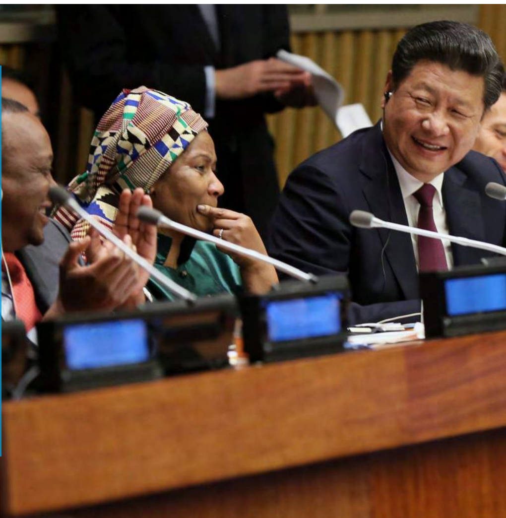
Photo: President of Kenya Uhuru Kenyatta, UN Women Executive Director Phumzile Mlambo-Ngcuka and President of China Xi Jinping at the Global Leaders' Meeting. 72 Heads and Deputy Heads of State and Government at the event followed UN Women's call to announce concrete commitments to Step It Up! for gender equality.

Global negotiations among governments result in commitments that raise standards and accelerate national and international action on gender equality and the empowerment of women and girls. UN Women provides evidence and leads advocacy to put women's rights and needs at the centre of these processes. We bring together partners from government, civil society, the UN system and academia; provide expertise and analysis; and highlight good practices from different countries and regions. In 2015, our efforts helped drive a series of landmark global agreements with breakthrough provisions on women's empowerment and created consensus to step up the pace to reach gender equality by 2030.