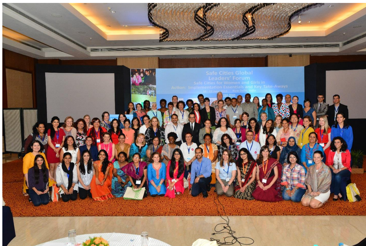
Safe City Leaders participating in UN Women's Safe Cities Global Leaders' Forum, June 10th-12th, New Delhi, India

This reality reduces women's and girls' freedom of movement. It reduces their ability to participate in school, work and in public life. It limits their access to essential services, and enjoyment of cultural and recreational opportunities. It also negatively impacts their health and well-being. Although violence in the private domain is now widely recognised as a human rights violation, violence against women and girls, especially sexual harassment in public spaces, remains a largely neglected issue, with few laws or policies in place to prevent and address it.