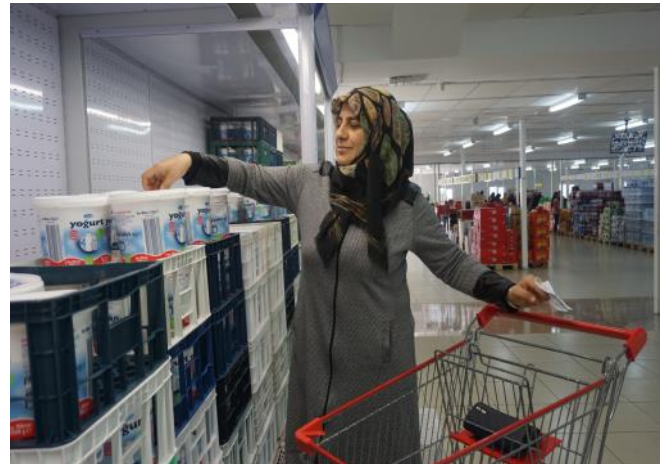
WFP's e-food card programme is implemented in partnership with the Government of Turkey and TRC.

More than 99 percent of refugees in Turkey live outside of camps in towns and villages. Many live in poverty. The most vulnerable of them are assisted by the Emergency Social Safety Net (ESSN) programme, which provides monthly cash assistance to more than one and a half million refugees (42.5 per cent of the total number of refugees living in Turkey) to help them cover their basic needs.