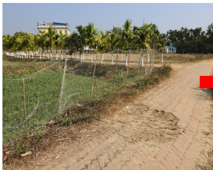
Repaired cyclone shelter