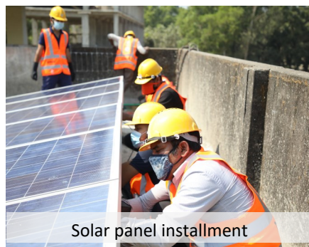
Solar panel installment