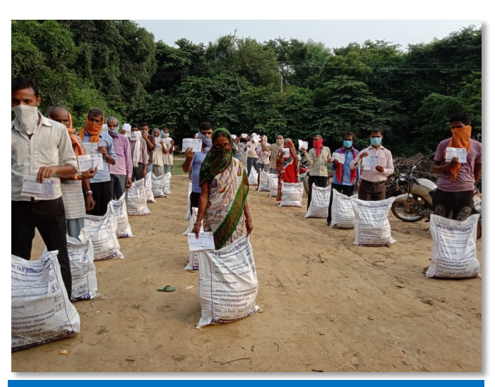
Snapshot of Lucknow's food distribution by SAMARTH

holds of transgender, female and male sex workers, migrants, disabled and chronically ill, comprising about a fourth of the total 4011 households, were covered in the