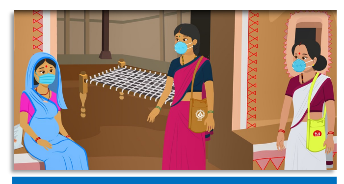
Snapshot of one of the Hindi-videos on COVID19 Prevention