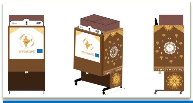
Annapurti – An automated multi-commodity grain dispensing machine